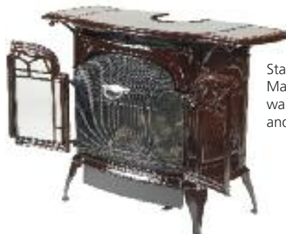
Stardance shown in Majolica Brown with warming shelves and screen front