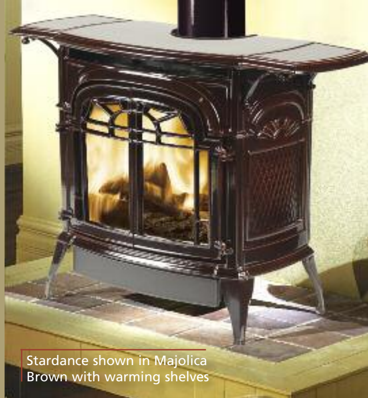
Stardance shown in Majolica Brown with warming shelves

"FireCast" burner delivers "Top in Class" dancing flame and intense radiant glow