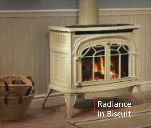
Radiance in Biscuit